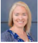
By STACIE TELLERS Legislative and Professional Standards Chair

The Washington State Legislature kept us on the edge of our seats regarding the State operating budget, waiting until the final hour of the last day of June. State agencies were prepared for a full or partial shutdown and local governments were scrambling to figure out how the shutdown would impact them. Alas, the operating budget was signed and all was “well”.