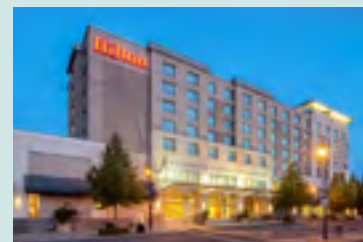
Hilton Vancouver Convention Center Vancouver, WA 98660

2018 WFOA Conference Sept. 18 - 21, 2018